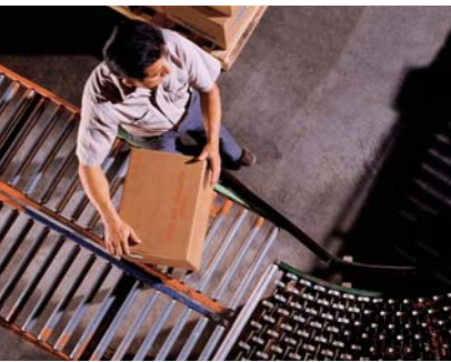
The goal of the members of the Corporate Honor Roll is to assure that their employees and families continue to have access to world-class medicine right here in Southwest Georgia.

Your tax-deductible corporate support helps us serve the health needs of your workforce and expand our corporate health programs, while it demonstrates your company's commitment to our community.