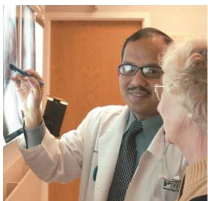
With each passing year, more and more cancer patients are receiving good news at the end of their treatment. Every donation helps makes more of these individual victories possible.

The pace of progress against cancer has been staggering. More new treatments have been introduced in the last seven years than in the previous 30. Resources provided by donors have made it possible to bring these life-saving technologies to Southwest Georgia as quickly as they become available. Every donation, of whatever size, helps save more lives.