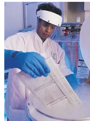
Patients at Phoebe Cancer Center have access to advanced treatments not available at smaller hospitals, such as stem cell apheresis, gene therapy and prostate brachytherapy.

Hope is not a term normally associated with cancer. Yet, over the last 40 years, the dedication of these medical professionals has helped make Phoebe Cancer Center a very special place, a place where Southwest Georgians can turn to as a source for hope for treatment and for recovery.