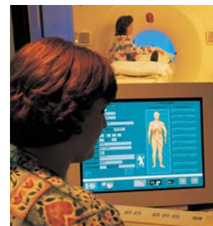
Southwest Georgia is home to a truly world-class cancer center, with the finest medical talent and state-of-the-art technology.

Today, through the efforts of dedicated researchers and medical professionals, there is increased promise of recovery, even eventual cure.